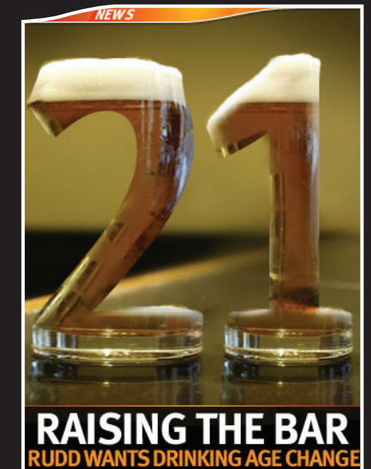
I guess the beer gods won this battle