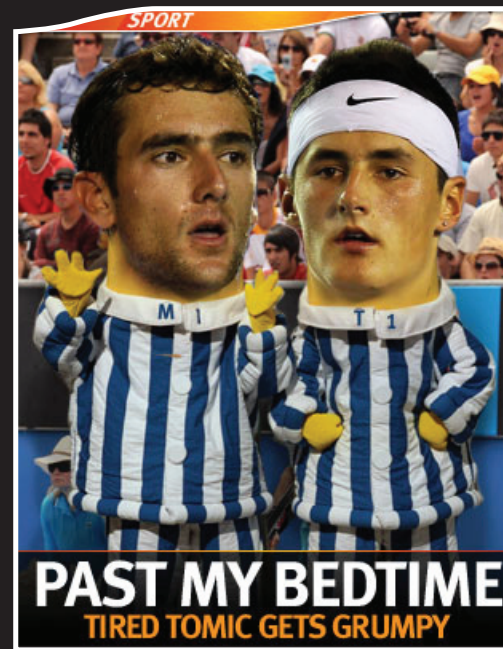
Bernard Tomic gets grumpy when an Australian Open match keeps him up until after 2am